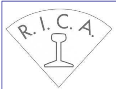
Railway Industrial Clearances Association - Representing the interests of the dimensional shipping industry.

Be sure and register for RICA's 37th Annual Meeting being held in Savannah, GA from June 13 to 17. Some topics to be covered on panel discussions are Open-Top Loading Rules, Use of Railroad Websites for Pricing, and Wind Energy and Railroads. There is expected to be a video presentation of the CEBX 800 36-Axle Schnabel Car load that is currently in transport from Houston to Colorado.