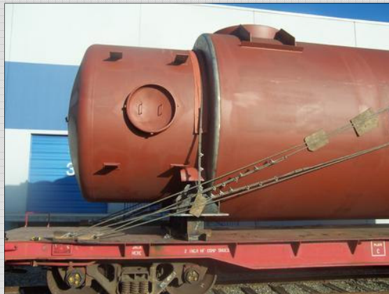
This 60 ton cold exchanger began its journey in Canada and was delivered in Mexico.

Specialized Rail recently completed its first trans-continental shipment that originated in Canada, crossed through the United States and delivered in Mexico. The cold exchanger, fabricated in British Columbia, was transported by truck from the fabricators shop and loaded to rail, where SRT managed the securement and rail transport.