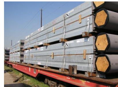
Tube Bundles loaded on flatcar.

With rising fuel costs and trucking rates, rail transport has become an alternative for general cargo. Earlier this year, SRT began transporting general cargo to destinations across the United States. They have also worked closely with trans-loaders to ensure that shipments are delivered on-schedule.