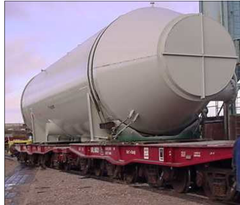
This 340 ton vessel was transported on two railcars as a bolstered load from Wyoming to Louisiana.

With an outside diameter of 14’ 1” and weighing 340 tons, the rail transport of this vessel from Wyoming to Louisiana was a welcome challenge for the team at Specialized Rail. The height and weight of this piece required the use of bolsters. Another obstacle encountered on this project was the different “Combined Center of Gravity” requirements by the two railroads involved in the transport. The load required ballasting for the last leg of the journey.