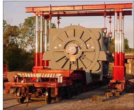
A heavy-lift gantry was used to load the 300 ton Generator on to the railcar.

The project required extensive work obtaining clearances. SRT worked closely with the other groups involved, including the heavy transport and rigging company that barged the generator and other pieces from the Port of New Orleans, LA.