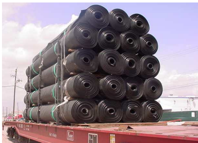
Plastic Rolls loaded on flatcar.

With rising fuel costs and trucking rates, rail transport has become an alternative for general cargo. Earlier this year, SRT began transporting general cargo to destinations across the United States. They have also worked closely with trans-loaders to ensure that shipments are delivered on-schedule.